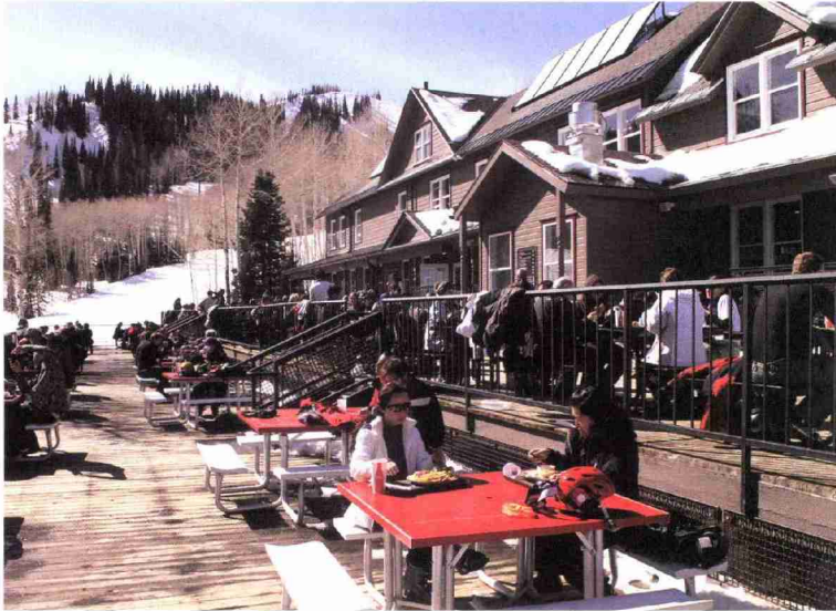
> Park City Mountain Resort is now owned by Vail Resorts.