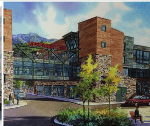
Newpark Hotel, Park City

Olympic spirit; in the summer they offer group bobsled rides, Quicksilver alpine slide rides, zip line rides, team building activities, athlete appearances and performances, guided tours, and introductory sport camps.