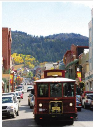
Main Street, Park City