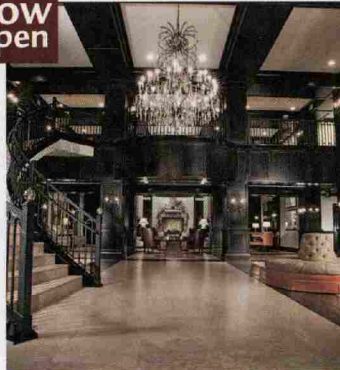
Elegant welcome: The Dakota Lodge lobby